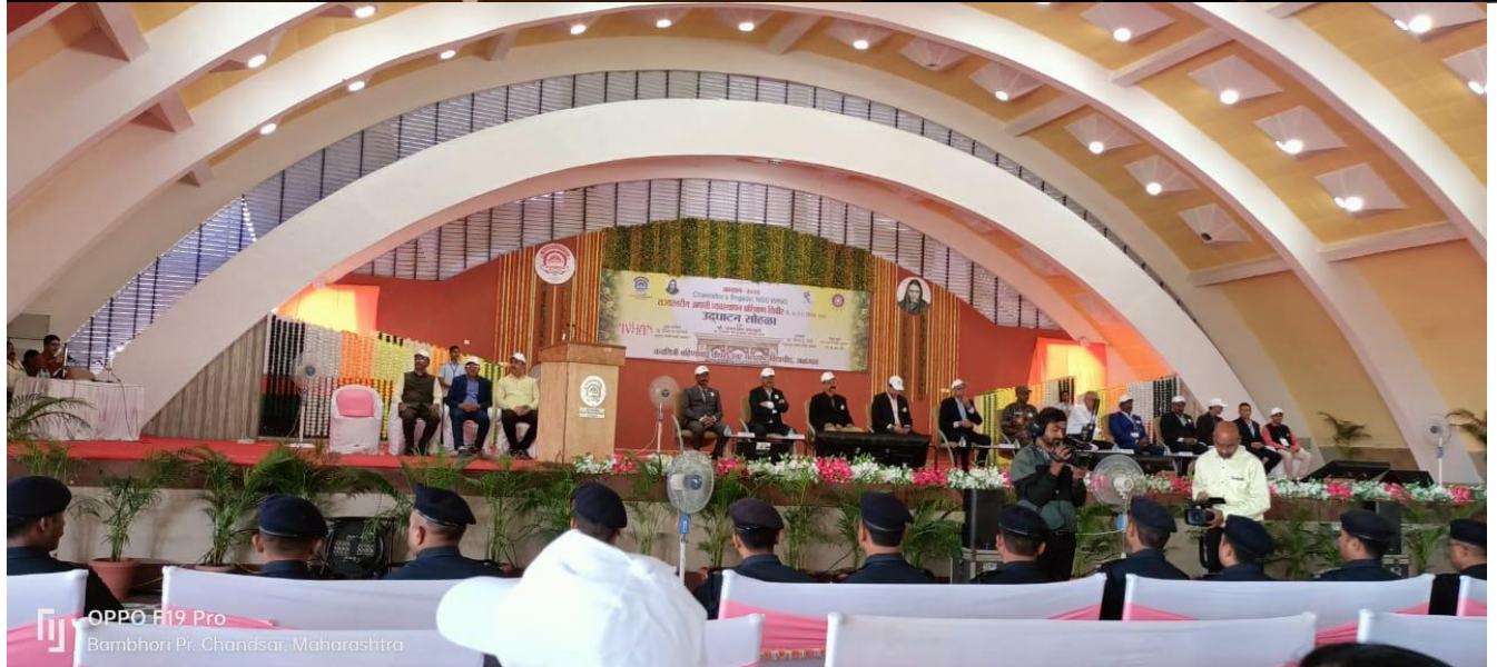
OPPO F19 Pro Bambhori Pr. Chandsar, Maharashtra